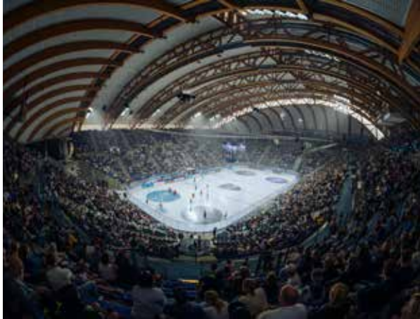
ZUCCARELLO ALL STAR GAME