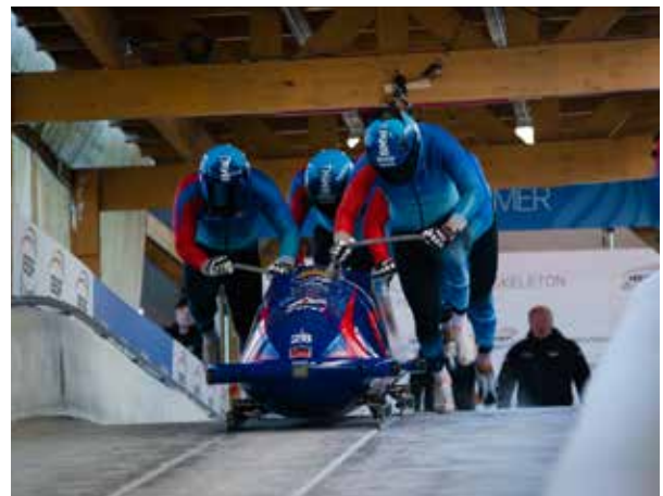
WORLD CUP BOB & SKELETON