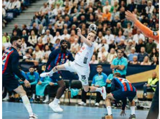
HANDBALL: BARCELONA - ELVERUM