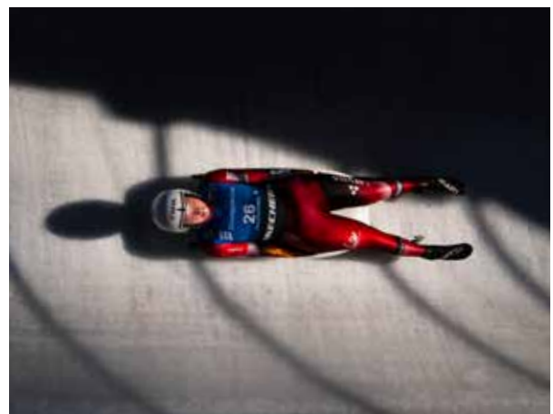
WORLD CUP LUGE