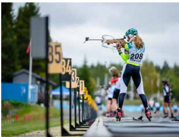
NORWEGIAN CHAMPIONSHIP, ROLLERSKI BIATHLON