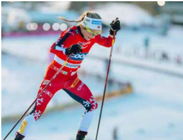
WORLD CUP CROSS COUNTRY