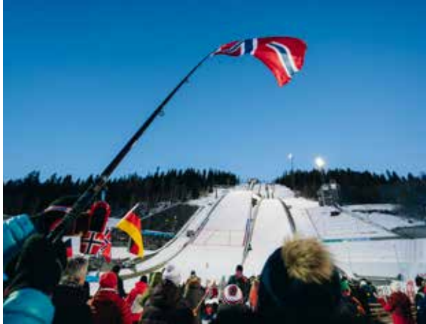
WORLD CUP SKI JUMPING