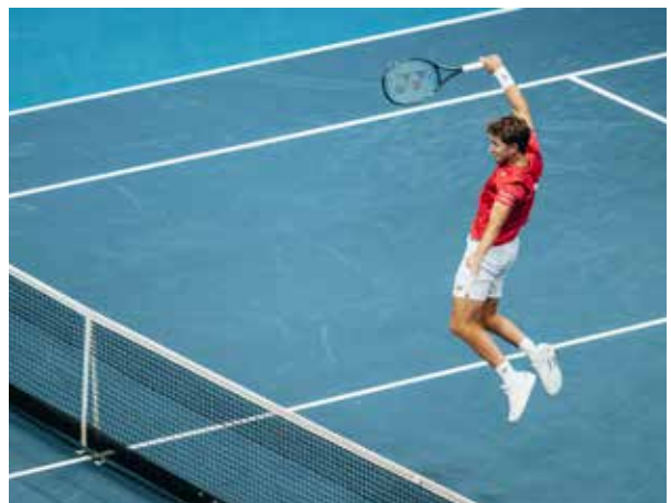
DAVIS CUP TENNIS