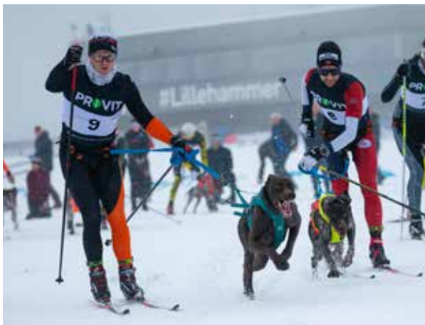
NORWEGIAN CHAMPIONSHIP WEEK